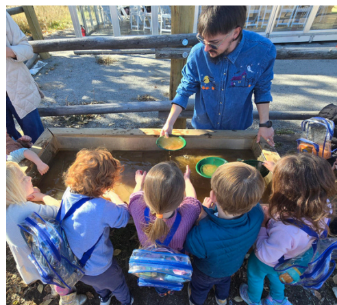
Abiyoyos Field Trip at Four Mile Historic Park